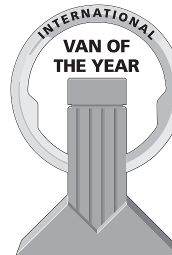
Based on European produced and sold model