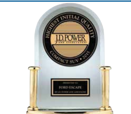
J.D. Power named the 2015 Ford Escape "Highest Ranked Compact SUV in Initial Quality in a Tie."

"The 2015 Ford Escape received the lowest number of problems per 100 vehicles among compact SUVs in a tie in the proprietary J.D. Power 2015 Initial Quality Study™. Study based on responses from 84,367 new-vehicle owners, measuring 244 models and measures opinions after 90 days of ownership. Proprietary study results are based on experiences and perceptions of owners surveyed in February-May 2015. Your experiences may vary. Visit jdpower.com.