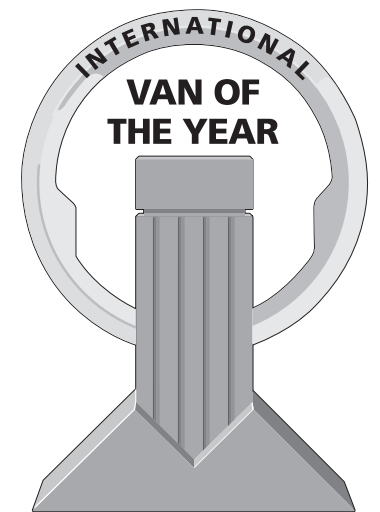
Based on European produced and sold model